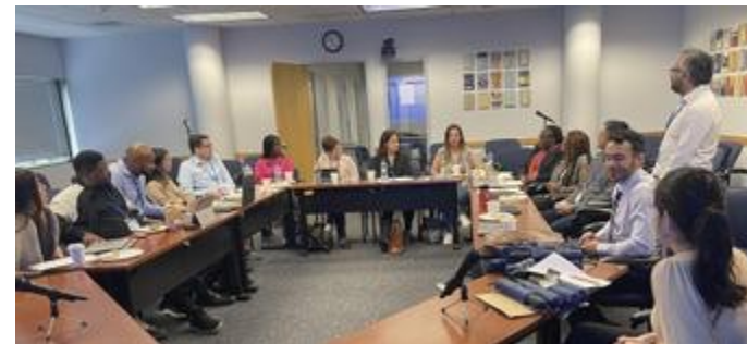
NBER Mentored Investigator Meeting on the Economics of Aging and Health