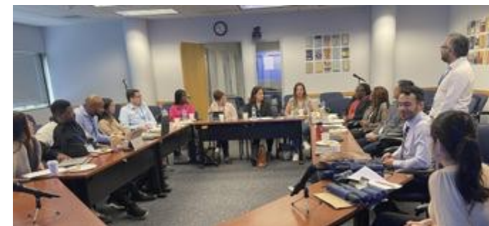
NBER Mentored Investigator Meeting on the Economics of Aging and Health